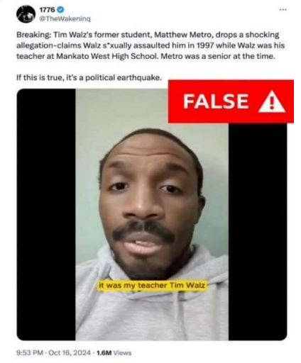
Figure 4: Deepfake video of an inauthentic-looking account claiming to be an assault victim of Tim Walz

6. The US elections also saw a large number of incidents where AI and deepfake technology were used to generate realistic looking videos to spread disinformation. For example, a deepfake video (Figure 4) of an individual who claimed to have been sexually assaulted by US Vice Presidential candidate, Tim Walz as a schoolboy was created to discredit Walz. The disinformation was further fuelled by screenshots of fake emails from purported victims from an anonymous account, and was amplified by supporters of Presidential candidate Donald Trump that appeared to be authentic.