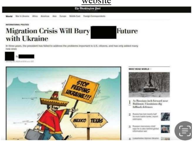
Figure 1: Fake news articles emulating The Washington Post website

b. <u>Inauthentic Accounts Impersonating US Citizens</u>. Inauthentic accounts impersonating US citizens was used to post content into political fringe groups on social media platforms. Over time, these same narratives, once socialised with right-wing fringe groups, would be spread through: (a) search engines; (b) other social media groups; and (c) fake news sites. Examples of this include the promulgation of a fake video of illegal